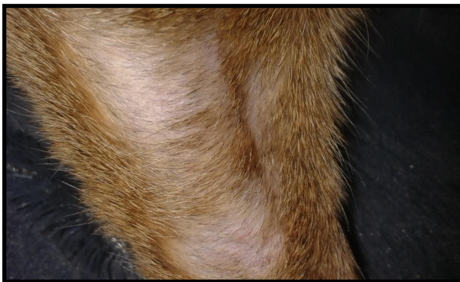
One of her front legs August 2015