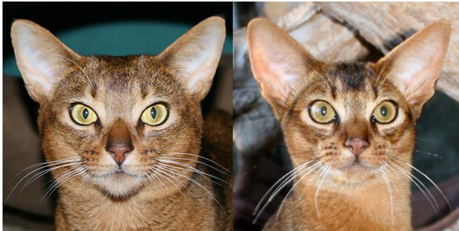
Left: Photograph 1 – Ears set wide apart and are moderately pointed on an adult male. Right: Photograph 2 – Good cupping and ear placement on an older kitten.

The use of the words ‘relatively large’ and ‘moderately pointed’ infers that the ears should be fairly large in relation to something, presumably the face, and shouldn’t end in a point but be slightly rounded at the top. The terms ‘broad and cupped at the base’ mean that the ears shouldn’t be narrow and need to have a wide base that curves around the edge of the head.