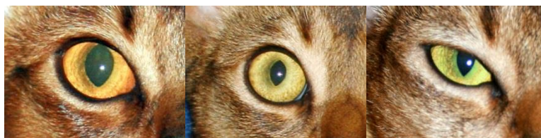
Photograph 1 – almond shaped Photograph 2 – more round than almond shaped Photograph 3 – more oriental than almond shaped

Illustrating the eye shape with photographs is difficult as the size of a cat's pupil may alter the impression of eye shape as may the use of a camera flash. And of course, cats will just hold their eyes differently depending on what they are looking at and the general lighting conditions in the area.