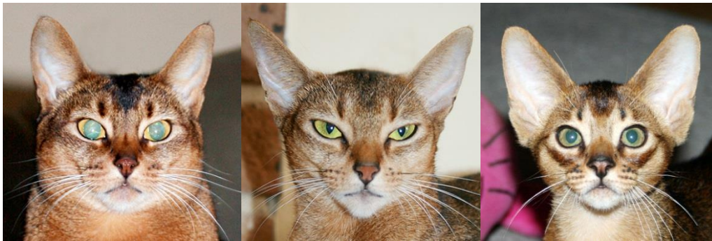
Left: Photograph 3 – smaller, narrow ears that are too high. Middle: Photograph 4 – long, narrow ears that are not broad enough at the base. Right: Photograph 5 – a kitten with narrow width but good-sized ears and cupping.

The use of the words ‘relatively large’ and ‘moderately pointed’ infers that the ears should be fairly large in relation to something, presumably the face, and shouldn’t end in a point but be slightly rounded at the top. The terms ‘broad and cupped at the base’ mean that the ears shouldn’t be narrow and need to have a wide base that curves around the edge of the head.