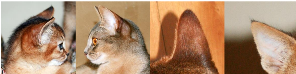
Left: Photograph 6 – kitten ears tilted forward to give the impression of alertness. Middle left: Photograph 7 – cat ears tilted forward. Middle right: Photograph 8 – Fur covering the ears with a thumbprint pattern. Right: Photograph 9 – very small tufts of fur on the end of the ear.

The ears help to give the Abyssinian cat its alert and expressive look, so when viewing them from the side, the ears need to be tilted forward to give the impression they are listening. The ears should have fur on them culminating in tufts on the ear tips. Ear tufts seem to be few and far between on the Abyssinians in Australia although some of the Somalis have retained them.