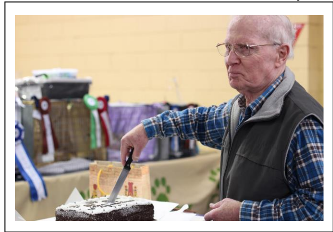
hope to see you in Canberra next May for the 31<sup>st</sup> show. Do bring most of your cats and friends!

and artistic judges' presents. Thanks finally to all the exhibitors who came from all around the country – I